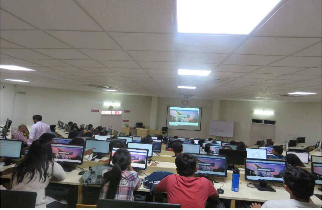
Students attending the EBSCO Training Session