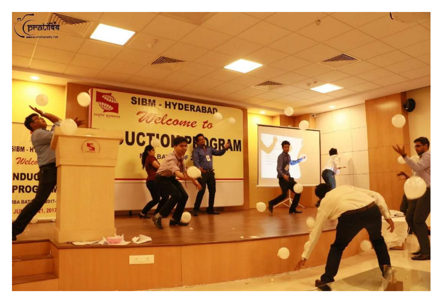
The students participating in the Ice breaking session

with the celebration and welcoming of the new batch of students, through an icebreaking fresher's party and various other activities and events organized for them.