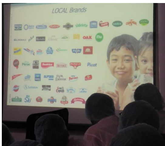
Lactalis Brand Portfolio