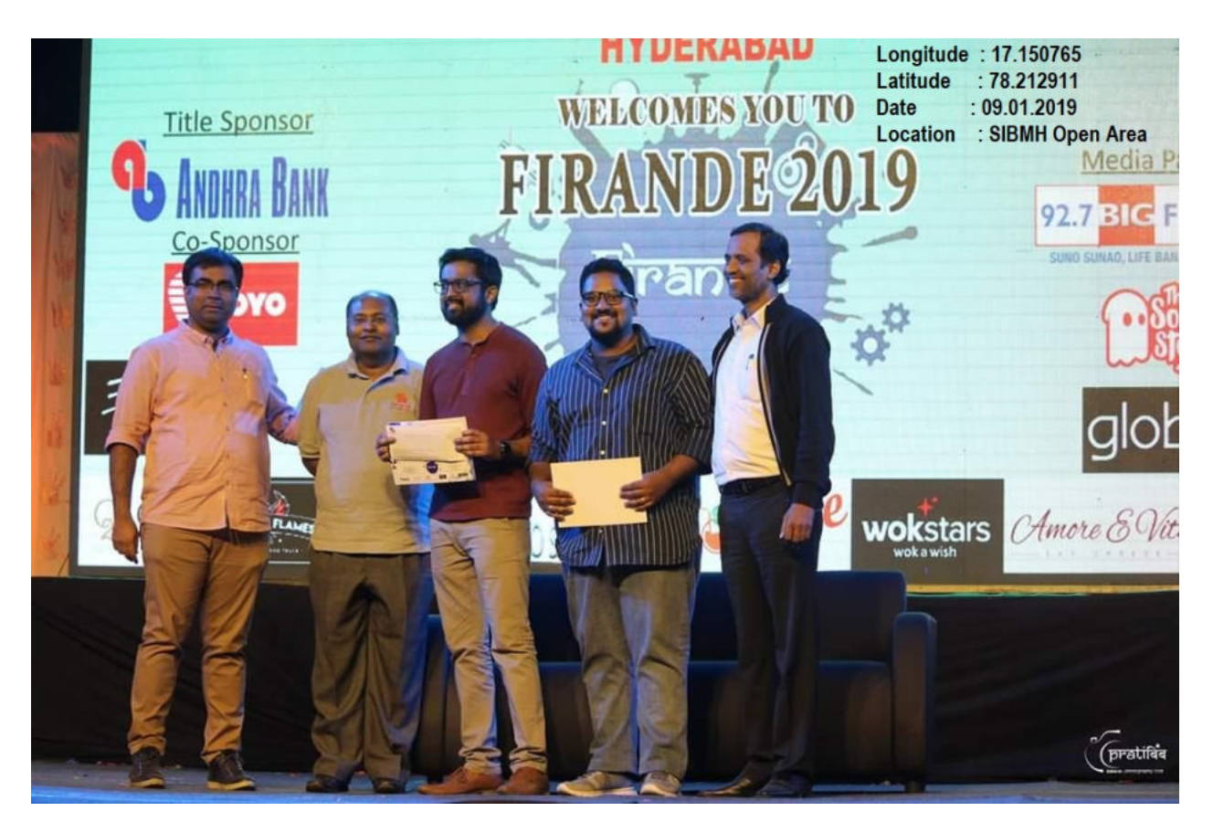
Felicitating one of the winning teams

A specially constructed stage, was the place for the valedictory function to take place.